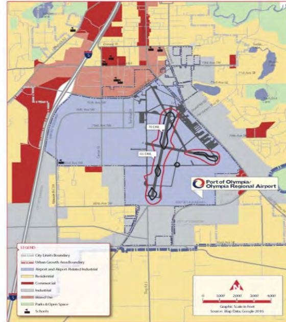
FIGURE D14 Future Noise Contours (2030) with Generalized Existing Zoning